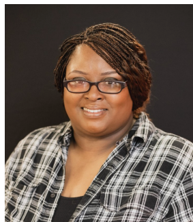
TROPHY THOMPSON Infant/Toddler Floater